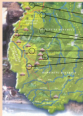
Map of Region 9 of Guyana, South America.