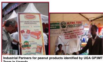
Industrial Partners for peanut products identified by UGA GP3MT Team in Uganda.