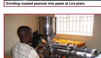
Filling jars with peanut butter at Lira plant.