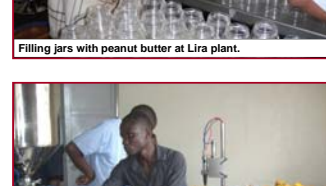
Plastic jars filled with peanut butter are closed with the eye-catching yellow lids.