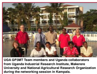
UGA GP3MT Team members and Uganda collaborators from Uganda Industrial Research Institute, Makerere University and National Agricultural Research Organization during the networking session in Kampala.