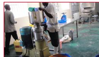
Grinding roasted peanuts into paste at Lira plant.