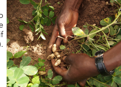
Pluck: Take pods from plants as soon as possible, or arrange in a way that allows for fast drying.