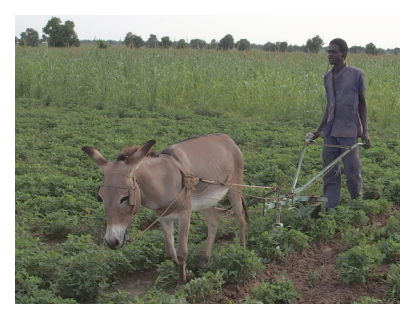
Fertilise evenly: If possible, fertilise with 150kg/ha DAP compound before planting.