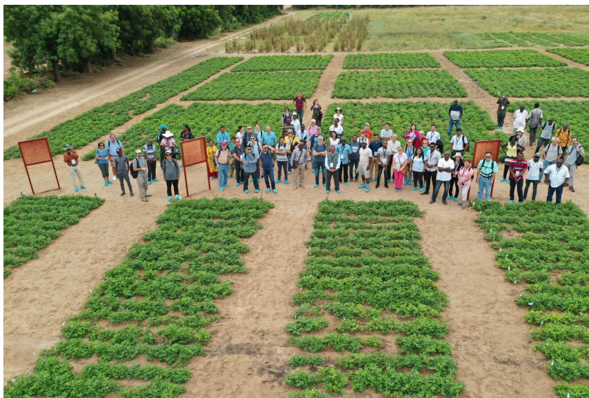
African peanut breeders stand in a field in Senegal where seeds were replicated for a project to map the genetic diversity of lines grown on the continent. Scientists genotyped hundreds of lines of peanuts grown across Africa.

The project – titled Genotypic analysis of peanut germplasm using the Axiom_Arachis2 SNP array – used the Arachis array (which contains 58,000 unique SNPs), as well as resources available on Peanut Base, a database of peanut genotypic and phenotypic data. Single nucleotide polymorphisms (SNPs) are differences that can be detected between the genomes of two